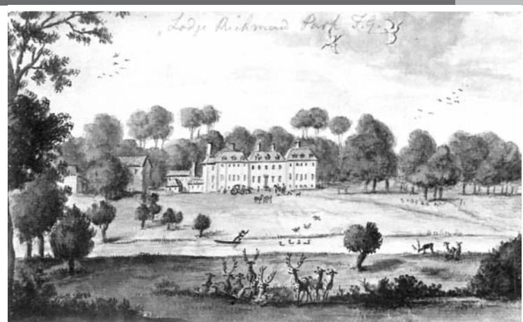
The Old Lodge by Francis Grose, c.1760

The fact that one of the two deputy park keepers appointed by the king, a man called Humfry Rogers, of whom we know nothing, immediately rebuilt the house with an allowance of £290, (roughly £25,000 in today's terms) indicates the state of the old farm buildings. In fact Rogers ran substantially over budget, probably spending more than £500.