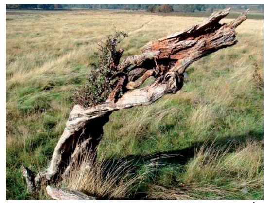
Hawthorn lives on

Trees seem such a natural feature of the Park landscape that it comes as something of a surprise to learn how much they have been planted and nurtured by human hands — and still are. Nature sometimes benefits from neglect; for example, some of the veteran oaks that predate the 1637 enclosure of the Park probably survived human interference because even then