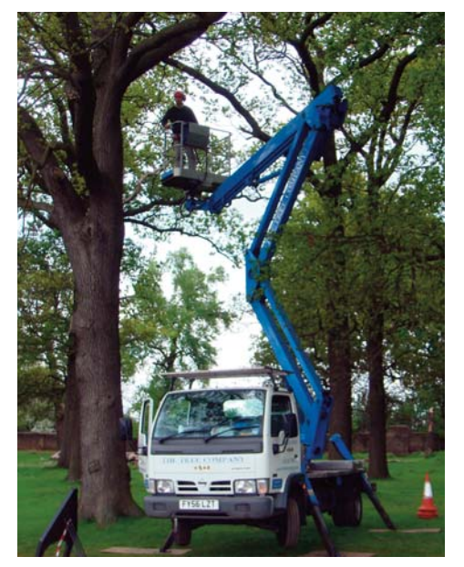
Looking for Oak Processionary Moths

Although our trees may not be quite as nature intended, they provide habitats and food for numerous resident and visiting species as well as incalculable pleasure to human visitors to the Park.