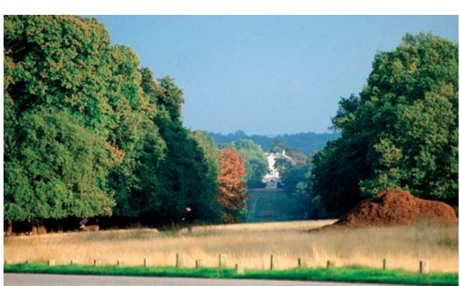
Looking towards White Lodge

For visits to the Museum, phone 020 8392 8440 or email museum@royalballetschool.co.uk.