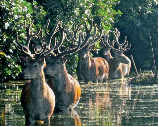
They look so harmless — but see next page.