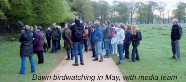
Dawn birdwatching in May, with media team see page 6.

Most summer visitors were forced to suspend their passage north until winds and temperatures became more favourable. When they did so on April 15th, three Redstarts, unusual spring visitors, appeared along with an unprecedented fall of 44 Wheatears. One of the male Redstarts stayed for