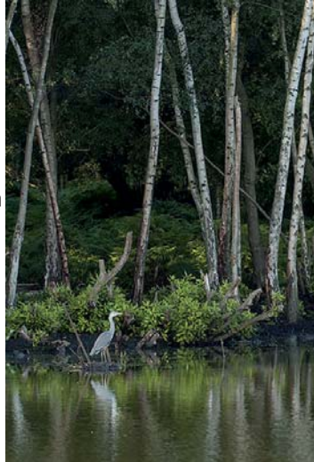
summer, it has become A Grey Heron takes advantage widespread in the Park. of the cleared shoreline to feed. It is a very invasive non-

Regular visitors to Pen Ponds may have noticed changes on wooded shoreline on the east side of Upper Pen Pond. Over the last three autumn-winter periods. overgrown Rhododendron has been gradually removed, eventually to be replaced by a naturally vegetated open shoreline, backed by a belt of native shrubs. Originally planted as a screen for the enclosed woods and for its large, ornate, purple flowers in native evergreen which