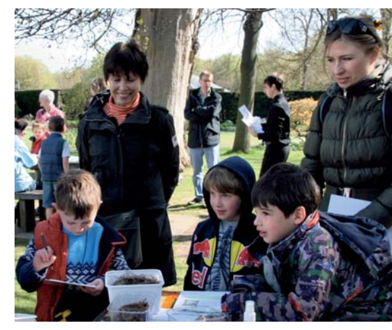
Nest handling at the "Meet the Birds" event in April.

In particular, we hope to involve families that do not know or visit the Park. By the time this newsletter is printed, plans