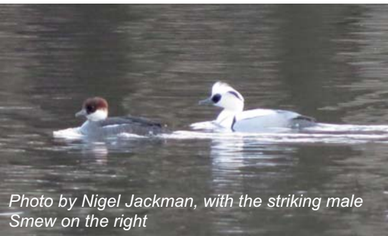
with the striking male Smew on the right

Probably only between 100 and 400 of these migrant ducks are seen in the UK each Autumn/Winter. They are the smallest of the so-called “sawbill” diving ducks, related to Mergansers and Goosanders. The Smew’s nearest usual wintering grounds are in the Netherlands.