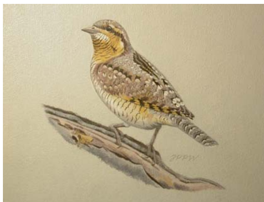
Wryneck Painting by Jan Wilczur

The number of species breeding in the Park was also probably a record with 60 species breeding or strongly suspected of doing so. Highlights were a pair of Meadow Pipits breeding successfully for the first time since 2008, and a pair of Stonechats also breeding – only the second occasion in the last six years. Several breeding species were only represented by a single pair. These included Collared Dove, Kingfisher,