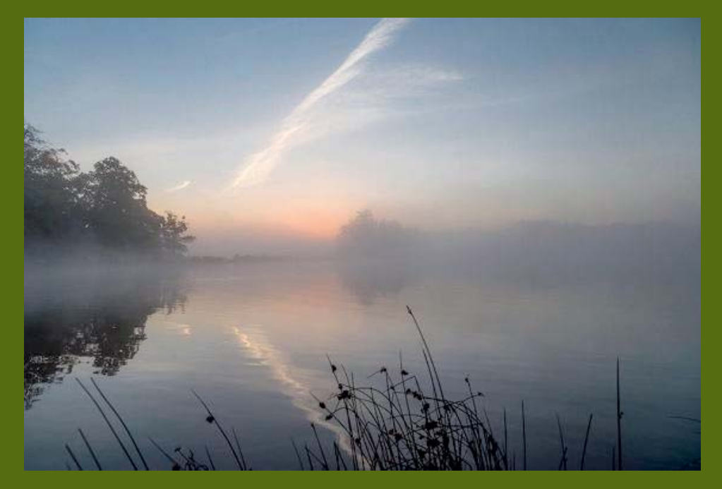
Pen Ponds