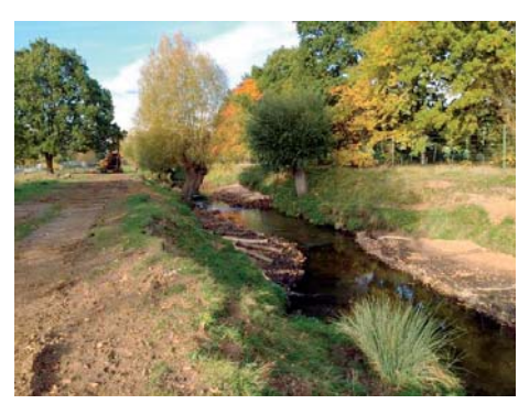
narrowing the channel to create diversity of flow (above);

The work on two sections of the Beverley Brook restoration was completed during last autumn creating a more natural stream and new wildlife habitats. In February, the Friends' conservation volunteers then planted a range of native species of trees and plants, largely those that exist in the Park currently or are known to have done so from historic surveys, including Pendulous Sedge, Lesser Water Parsnip, Yellow Flag Iris, Amphibious Bistort, Purple Loosestrife and Creeping Jenny (such wonderful names!). However, it will be 2-3 years before it looks fully green again. The works included: