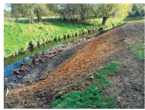
shallower banks which create a new habitat and enable growth of marginal plant species;

woody material fixed to the bed and new gravel banks (to the left of the timber) to help flow diversity and provide habitat for fish to spawn and shelter (previous column);