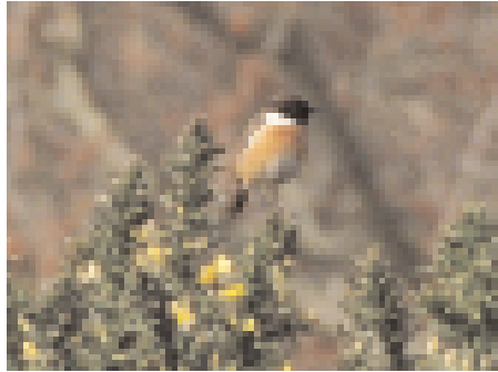
Above: Male Stonechat in gorse enclosure

birds started to use them as nesting sites. Below are a couple of the annual visitors that have regularly bred in these enclosures since they came into being.