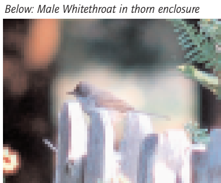
Below: Male Whitethroat in thorn enclosure

This great success story has nevertheless brought with it its own problems. We had never intended the enclosures to be permanent, we just wanted to give the scrub a sufficient period of protection from the deer to enable thickets to be established. However, these new thickets have become such important breeding grounds for some of our smaller and less common birds that we would not now want to risk their destruction, by leaving them entirely unprotected.