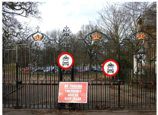
Robin Hood Gate, permanently closed to traffic

In June, the reduction to 20mph was debated in the House of Lords on two occasions. First it was proposed that the