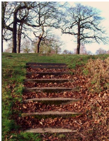
Steps near Kingston Gate marking the site of the former WRAC camp

The committee decided that the subscription rate for members should be set at a very low sum — from only 2/6d (£2 at today's prices) — in order that no-one be discouraged from joining on the grounds of cost. It was hoped this would also maximise the numbers of supporters signing up.