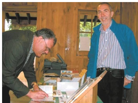
A volunteer signs up a new member at the Visitor Centre

The Friends were happy to support this venture, as it was a great opportunity to