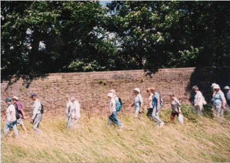
The Walk the Wall event repeated in 2003

The Friends celebrated the 350th anniversary of the walling-in of the Park with a walk around its boundary in May 1987. Nearly 150 people gathered to participate in the “Walk the Wall” event, and to celebrate the act that preserved this unique place for future generations. The walk was to be repeated on several future occasions.