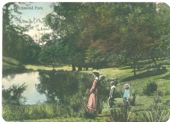
Postcard from the Hearsum Collection