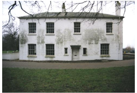
Pembroke Lodge badly in need of renovation

There had been concern about the future of Pembroke Lodge for many years. The Royal Parks operated it as a cafe, but it was in a poor state. The lease on the building, held by The Crown Estate, was due for renewal in 1999. Despite its being a listed building and of great historical interest, The Crown Estate felt that the house was now in such a state